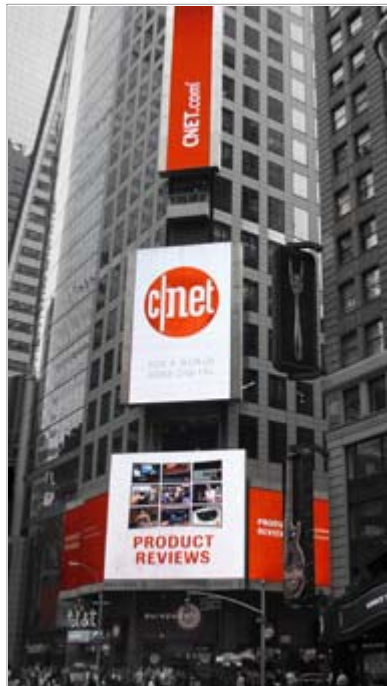
CNET in Times Square